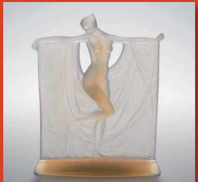
Suzanne statuette (1925)