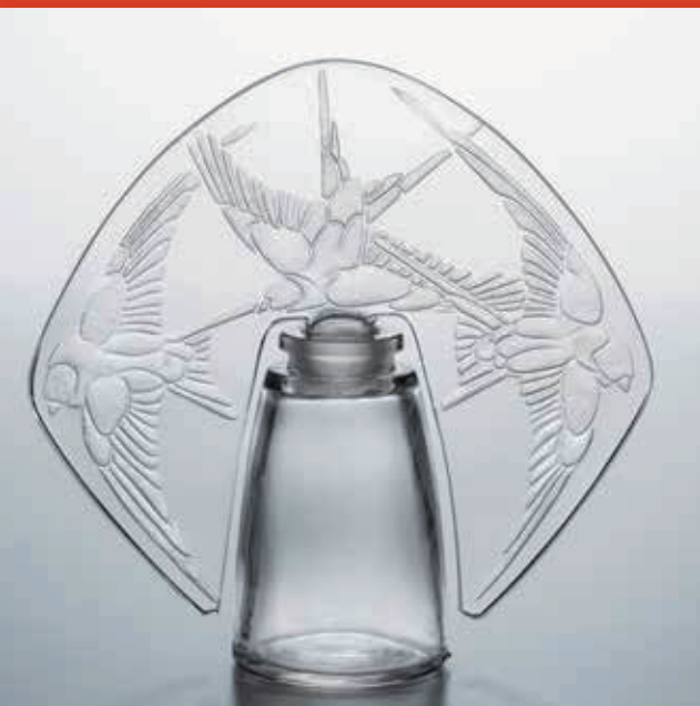
Perfume bottle with three swallows (1920)