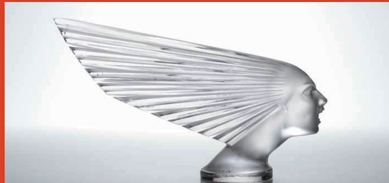
Goddess Victoire sculpture (1928)

Experience art in Nibappu that you won't find in Paris or Tokyo.