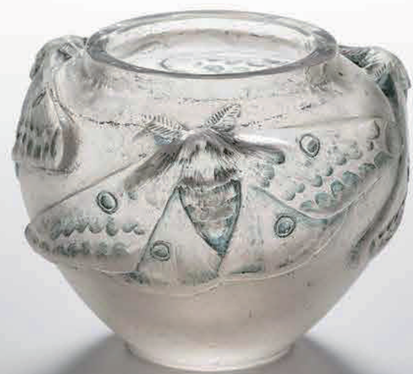
Wax-molded vessel with three butterflies (1913)

One of Japan's largest collections Exhibiting over 350 pieces from the master himself